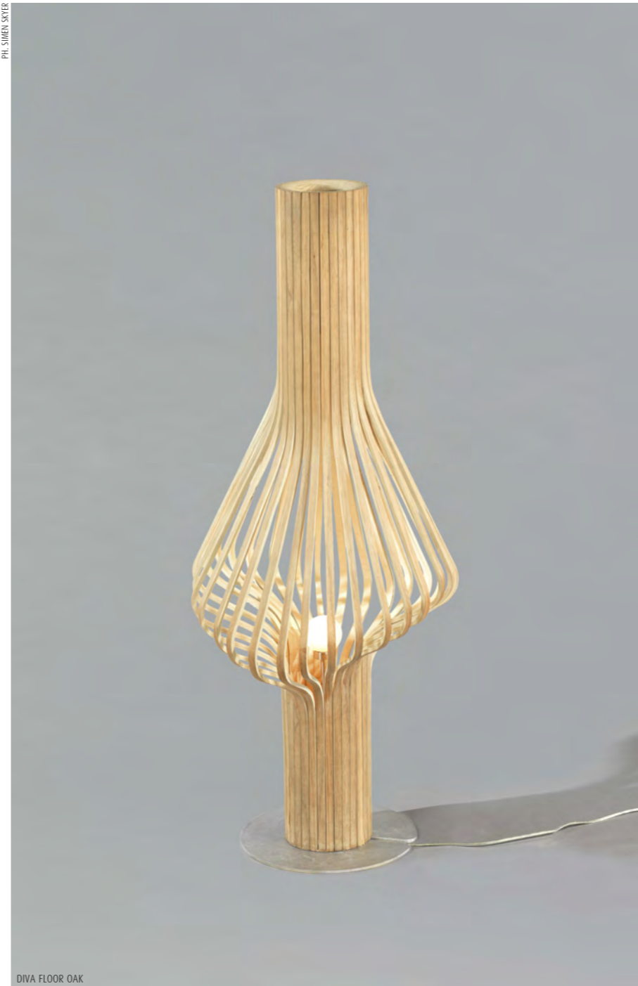
DIVA FLOOR OAK

Diva (Design 2009) Diva is a set of wood laminated floor and pendant light sculptures. By making a contemporary light object the two young designers, Thomas and Peter, wanted to pay their respect to the proud Norwegian heritage of wood lamination craftsmanship, and at the same time challenge or reinvent how this material can be used.