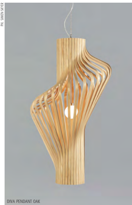
DIVA PENDANT OAK