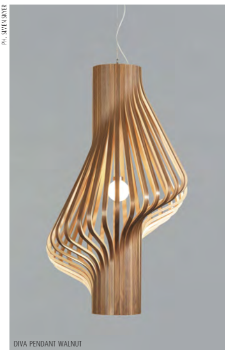
DIVA PENDANT WALNUT